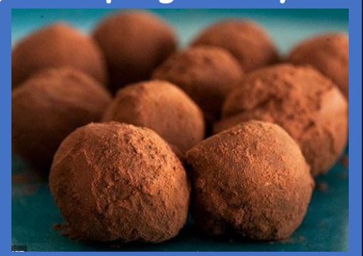
Spring Chocolate Truffles and Chocolate Butterfly Eggless Sponge Fairy